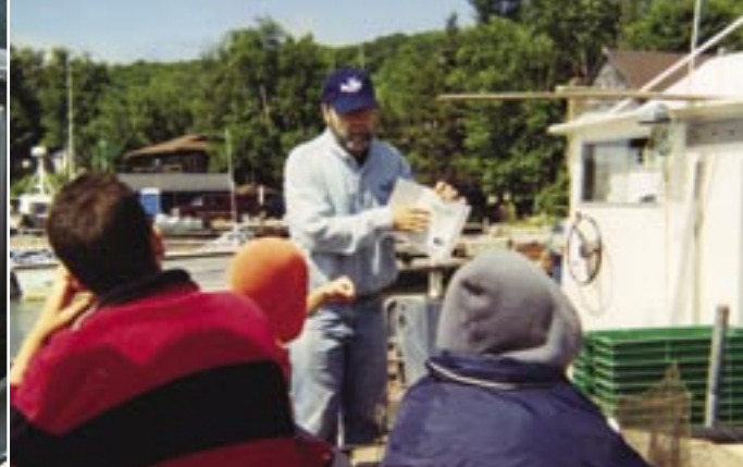
ALGER COUNTY MSU EXTENSION

More than 400 students have participated in the Life of Lake Superior Youth Program since it began in 2000.