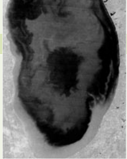
Circulating sediment, nutrients, and chlorophyll a form an unusual doughnut pattern in southern Lake Michigan. Sea Grant researchers are studying the impact of the phenomenon on winter food web productivity.

According to researchers, the circular pattern coincides with a late-winter distribution pattern of phytoplankton and zooplankton. The winter productivity pulse marked by the "doughnut" helps explain how