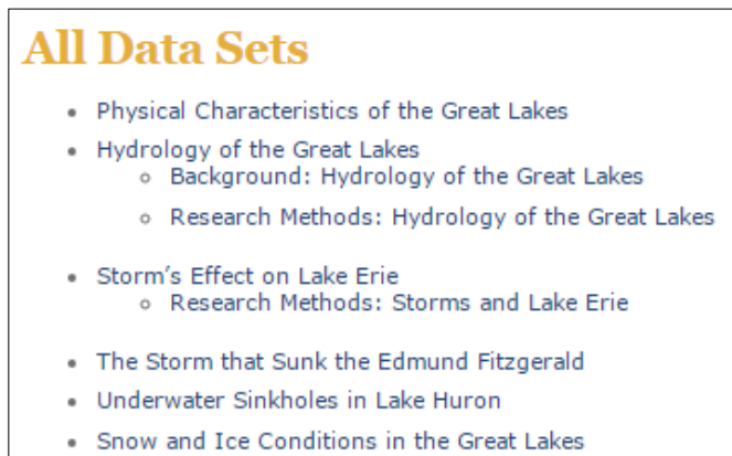
Figure 2. Data sets are simplified for use by teachers, and available separately from the Teaching Great Lakes Science lessons for adaptation into other lessons and activities.

to the All Lessons organization. Background information and related resources are provided for some data sets.