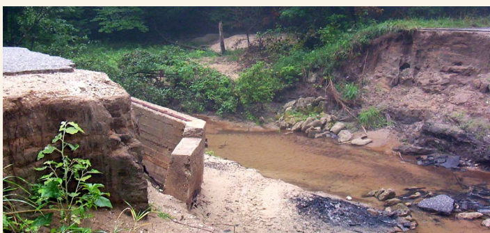
This rural road was completely washed out by an extreme storm on June 12, 2008. The Conservation Resource Alliance and Big Sable Watershed Restoration Committee are working to prevent this type of damage in the future.