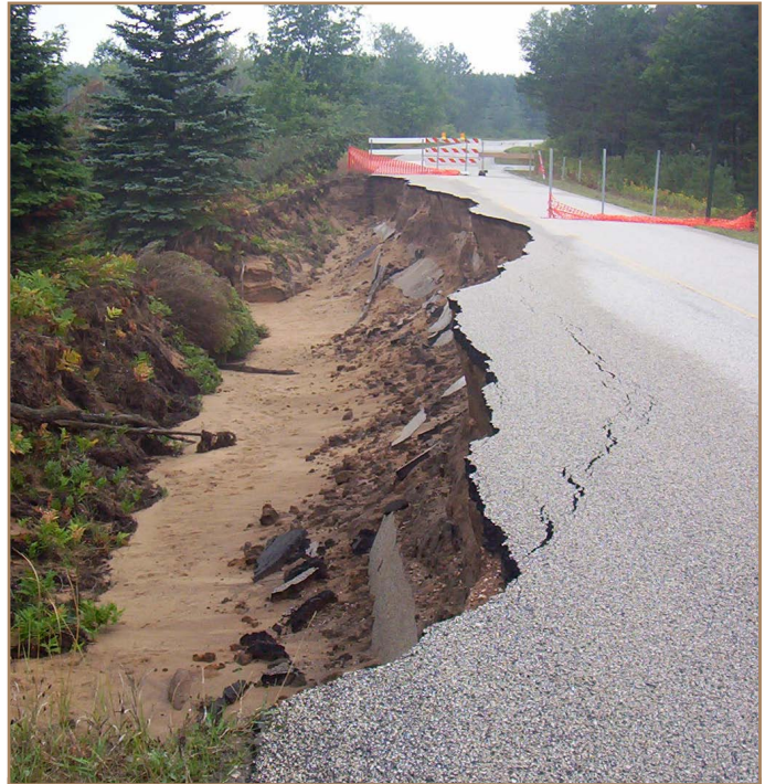
Road damage on Lake Michigan Drive near Ludington due to runoff from the June 12, 2008 storm that dumped 10 inches of rain in 12 hours.

The effects of a changing climate add yet another layer of variability. In recent decades, we have seen more severe and frequent extreme events like the Ludington storm in 2008 (see sidebar), and heat waves like those experienced in Michigan during summers of 2006 and 2010. Scientists expect these trends to continue. Whether or not they do, climate and lake levels will continue to be variable. For instance, lake levels may seem low now, but they will eventually rise again. Building coastal infrastructure expecting