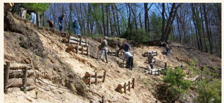
Volunteers work to terrace an eroding bank and install native plants on a Big Sable river bank. CRA and partners use these techniques to prevent erosion and protect fish habitat in the Big Sable watershed.

The Conservation Resource Alliance (CRA) works with many partners to restore stream habitat in northwest lower Michigan. The CRA and Big Sable Watershed Restoration Committee has upgraded two road/stream crossings in the Big Sable River watershed. “A lot of our watersheds are plagued with undersized structures (culverts) which have many negative ecological implications. They negatively affect aquatic species passage and sediment and nutrient