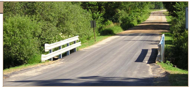
This upgraded road/stream crossing in the Big Sable watershed in northwest lower Michigan is now more resilient to erosion damage from heavy downpours.